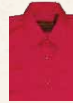
Hot Pink 8006-T